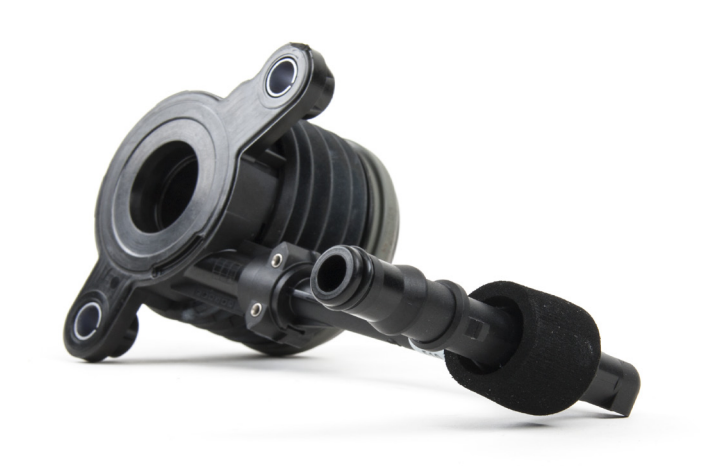
Fig. 2: Concentric slave cylinder with large hydraulic connection

Please observe the vehicle manufacturer specifications!