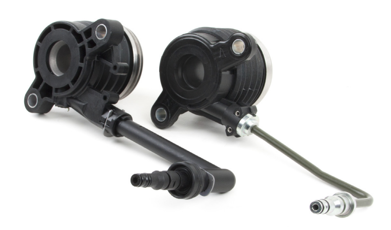
Fig. 1: Concentric slave cylinders with small hydraulic connections