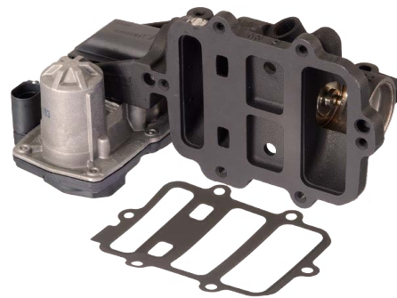
EGR valve with gasket (item no. 7.04999.34.0)

The newly installed EGR valve is not the cause of the whistling.