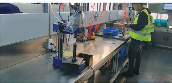
All calipers are subjected to rigorous testing at every stage of production, ensuring their durability and safety.