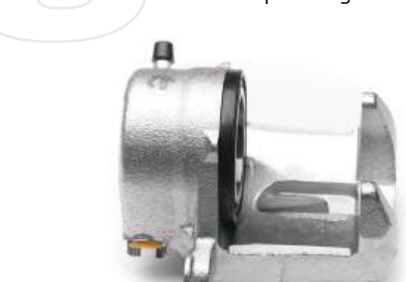
A FLOATING, INTEGRATED AUXILIARY BRAKE-EQUIPPED brake caliper I e.g. 34SKV271