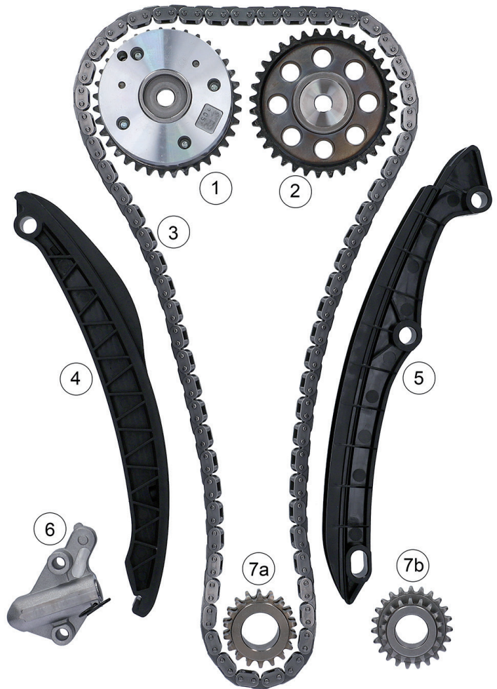
Figure 1: 559 0154 30/559 0154 31 – Timing chain KIT components

For the engine listed above, the crankshaft gear for the timing chain system is available in four different tooth pitches.