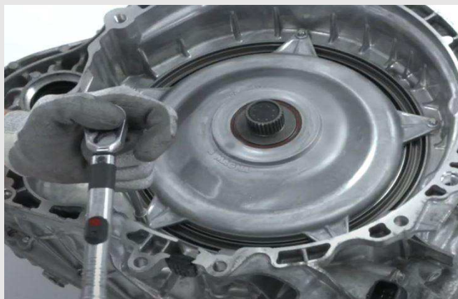
Step 9 Install the cover and apply the torque provided in the fitting instructions