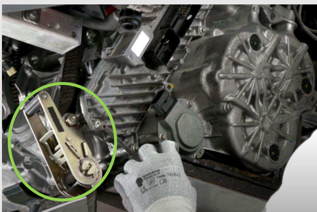
Step 3 To avoid accident, use the correct tool to manage slowly and safely the gearbox from the vehicle