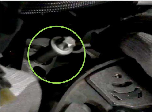
Step 11 Install flywheel blocking tool