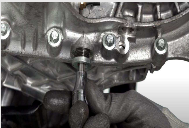
Step 1 Drain the transmission oil