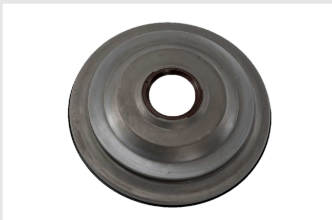
Step 7 Install the new cover (803018)