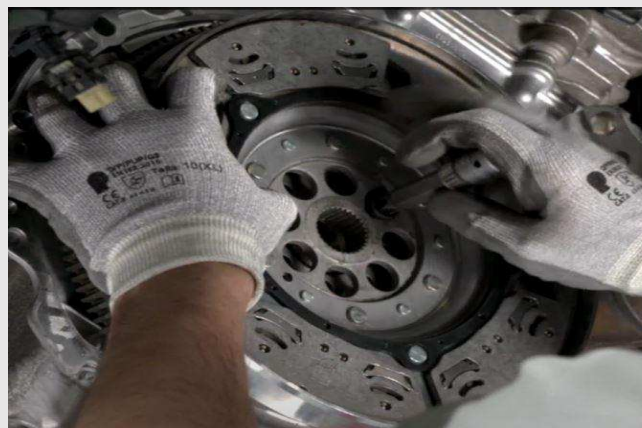
Step 10 Install the flywheel applying the correct torque provided in the fitting instructions