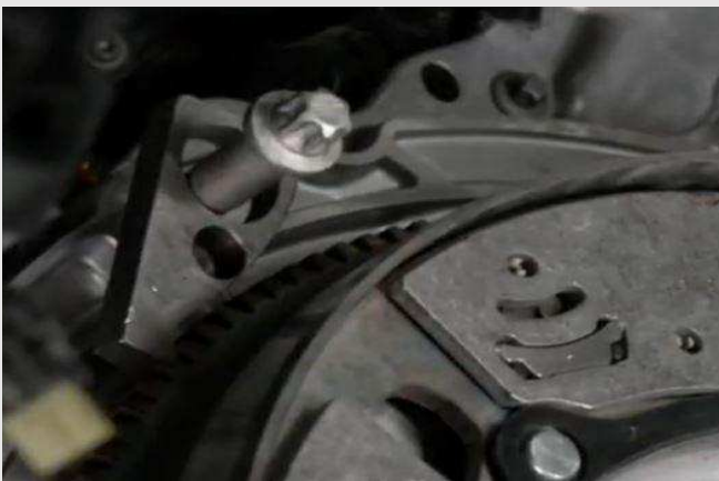
Step 13 Don't forget to remove the flywheel blocking tool