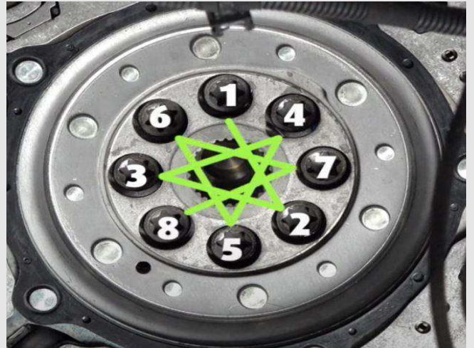
Step 12 Apply torque and tight the bolts in star sequence NEVER use impact tool