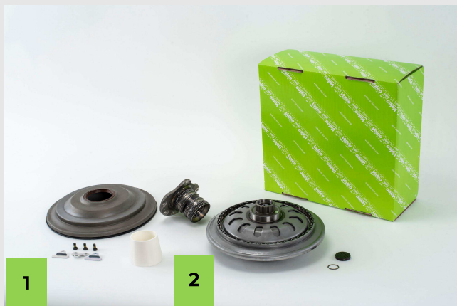
Step 8 Install the new cover using the bolts and the support [1] and using the specific tool [2] to locate the cover on the axle