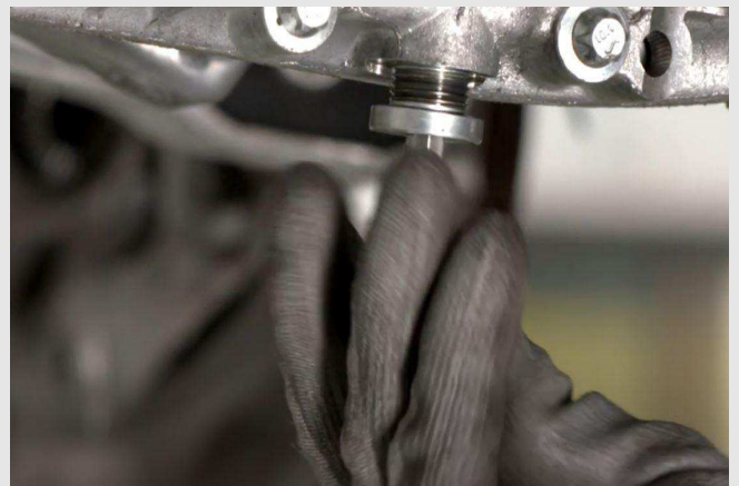
Step 2 Clean & install the oil plug