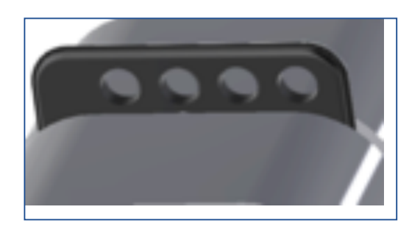
CYLINDER HEAD + GASKET + BLOCK