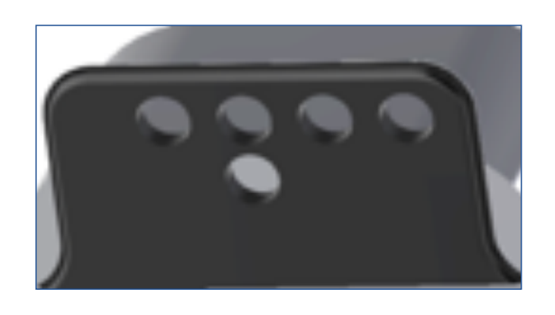
GASKET + BLOCK