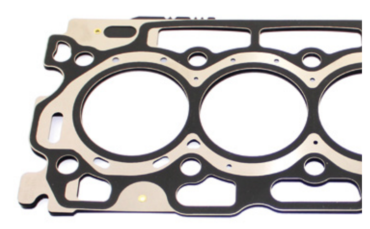
Multi Layered Steel Gasket