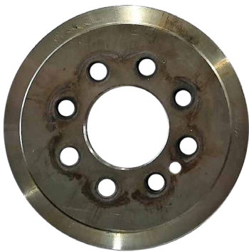
METAL SHEET DISC