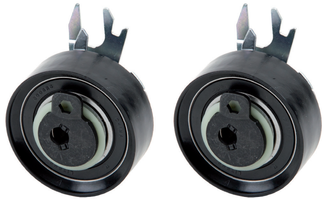
Figure 1: Left - Tensioner pulley 531 0252 30, right - tensioner pulley 531 0525 30

For current listing refer to catalogue media