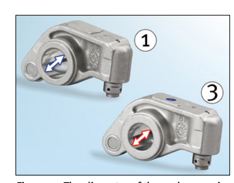
Figure 2: The diameter of the rocker arm is greater on the intake side (1)

When fitting these parts, ensure they have been correctly allocated. Differences between these parts can be observed in the differing diameters of the hole for the rocker arm shaft (Figure 2) as well as in the crank of the roller type rocker arm (Figure 3).