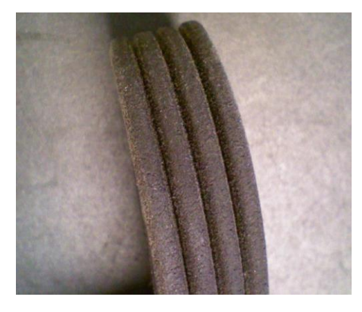
Example of a modified multi V-belt

The modified belts can be used without reserve for the automotive applications specified in the catalog. Despite the optical differences, the new finish has no adverse impact on performance.