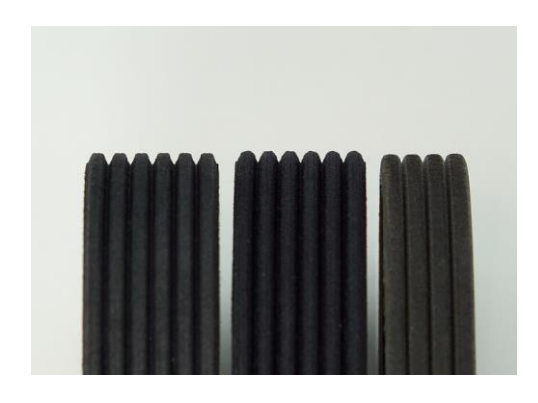
The modified profile section types – difficult to detect with the naked eye