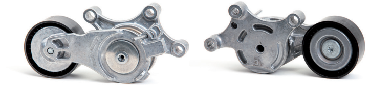
Figure 2: New design

As part of our continuous efforts to improve our products, modifications have been made to the belt tensioner with part number 534 0075 20.