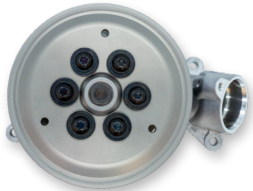
Complete kit 7.10942.58.0 – fully assembled water pump with pulley and screws

The water pump with OE-Nr. 06M 121 013 D has no longer been available as OE since January 2025. It was replaced by OE-Nr. 06M 121 013 G. As the new water pump 06M 121 013 G has a different hub (six holes instead of four), not only the variable water pump, but also the pulley and the bolts must be replaced in the event of a replacement.