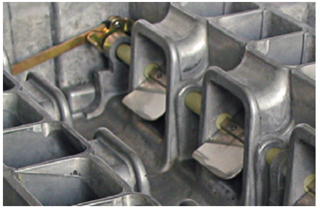
A view into the interior of a variable intake manifold