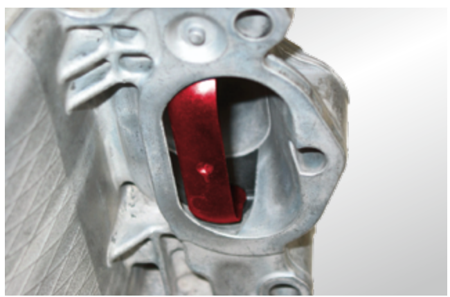
Tumble flap (highlighted in red) for stratified charge operation