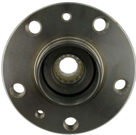
Bearing with plastic Joining sleeve

SKF use safe packaging solutions to protect the wheel bearing from damage during transport or mounting. VKBA 3442 is delivered with a plastic joining sleeve, to keep the inner rings together, until the bearing is mounted on the car.