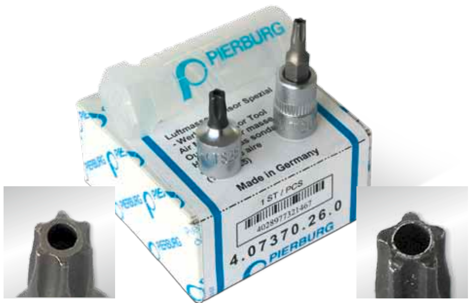
Insert bit T 20 (6 star pattern, Torx®) with face bore

The replacement of standard air mass sensors is hampered through the use of special screws. For such repairs Motor Service is offering a new special toolkit consisting of two insert bits. These special screws feature a solid post located at the centre of the five star, respectively six star pattern of the screw. Owing to the bore on the face side of the insert bits, these special screws can be unscrewed. The two tools are 1/4-in. insert bits of proven MSI quality which will fit all commercially available 1/4-in. ratchets or socket wrenches.