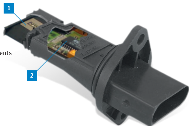
Hot-film air mass sensor (newer design, cutaway view)