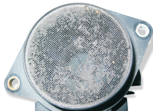
Blocked air mass sensor