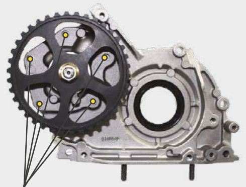
The bolt holes are accessible: Pulley removal is not necessary.