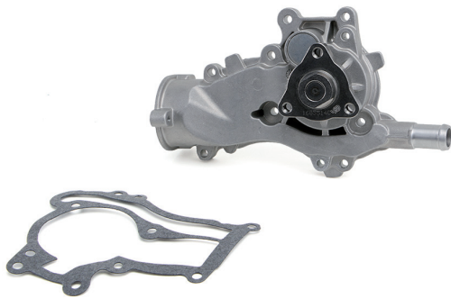
Fig. 1: 538 0314 10 - Coolant pump with accompanying gasket

For current listing refer to catalogue media