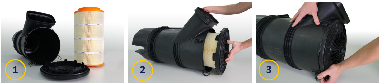
E1572L from Hengst with MAN air filter housing